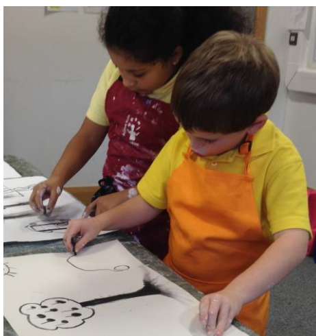
Concentrating hard on their charcoal drawings

Each class produces a curriculum map for the year and each term a topic plan is published on the class pages on our website.