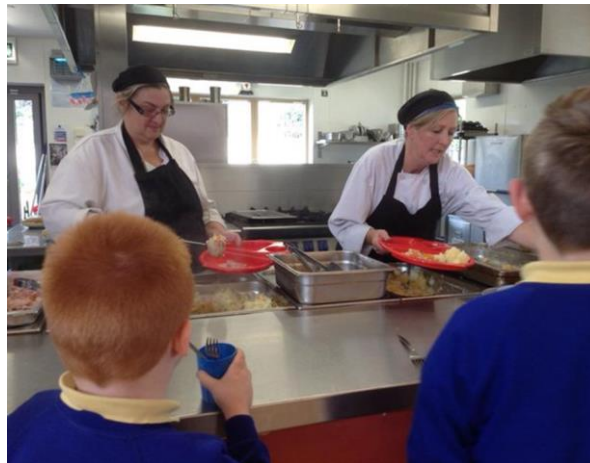
Serving hot school meals every day