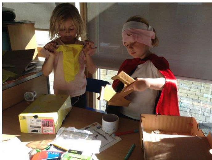
Superheroes making their costumes

Our Infants children perform a Nativity-based play at Christmas with Year 2 taking on the lead roles. In July, KS2 perform an end of year production of their choice with mostly Year 6 taking on the lead roles.