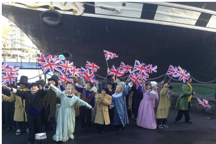
Visiting SS Great Britain

Although we allow photography at special events, we do so on the proviso that you focus your attention on your child and that you never post any images of any children, other than your own, on social network sites without the express permission of that child's parents or carers. We ask every parent to sign an Acceptable Use Agreement when their child starts here to agree some basic ground rules.