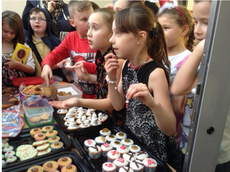
Selling cakes to raise money for charity

We encourage our children to take responsibility for their own performance and to measure their successes against their own baseline whether that is in academic, sporting, musical or other areas.