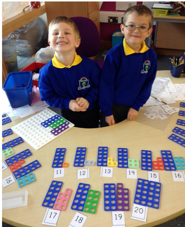
Using Numicon helps develop our understanding.