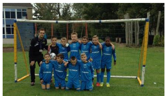
Our football team at their away game.