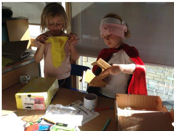
Superheroes making their costumes

Our Infants children perform a Nativity-based play at Christmas with Year 2 taking on the lead roles. In July, KS2 perform an end of year production of their choice with mostly Year 6 taking on the lead roles.