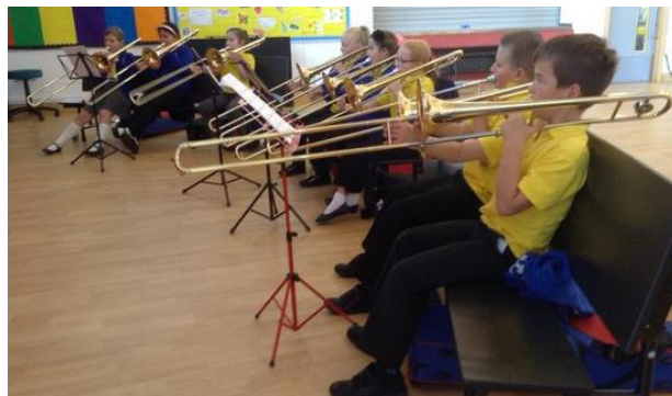
The trombone is one of the instruments we offer lessons in.

Currently, we also run a Recorder Group.