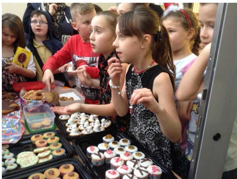
Selling cakes to raise money for charity

We encourage our children to take responsibility for their own performance and to measure their successes against their own baseline whether that is in academic, sporting, musical or other areas.