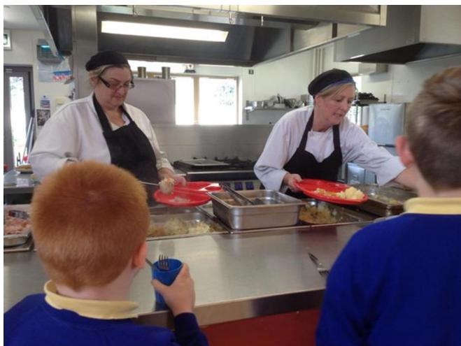
Serving hot school meals every day