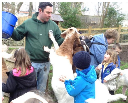
Some very hungry goats at Windmill Farm

Each class produces a curriculum map for the year and each term a topic plan is published on the class pages on our website.